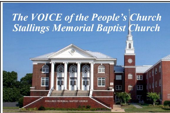
The VOICE of the People's Church Stallings Memorial Baptist Church

Newsletter DEADLINE Deadline for submitting articles/notices for the Jan. 4th newsletter is Thursday, Dec. 28th.